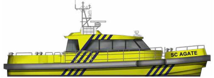
GENERAL ARRANGEMENT SC AGATE

For more information please do not hesitate to contact us, we'd love to get in touch.